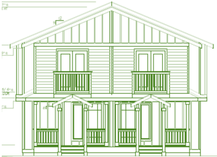
ELEVATION - FRONT